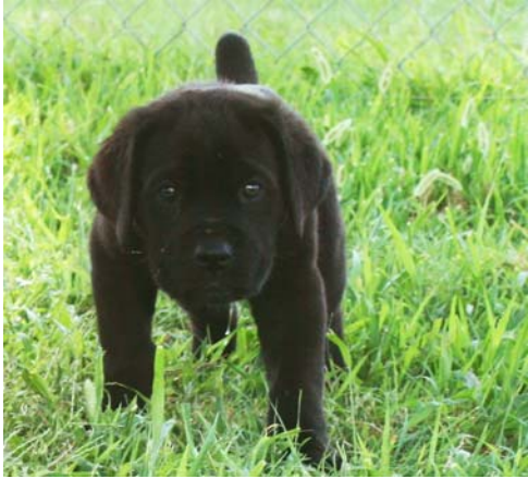
6 Wks Old